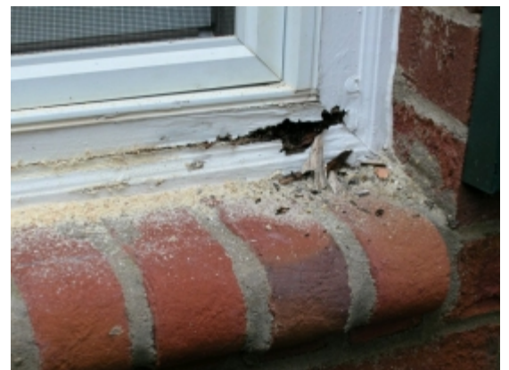
ROTTING BRICKMOULD (WINDOW WAS MOUNTED INTO OPENING IN PHOTO ABOVE)