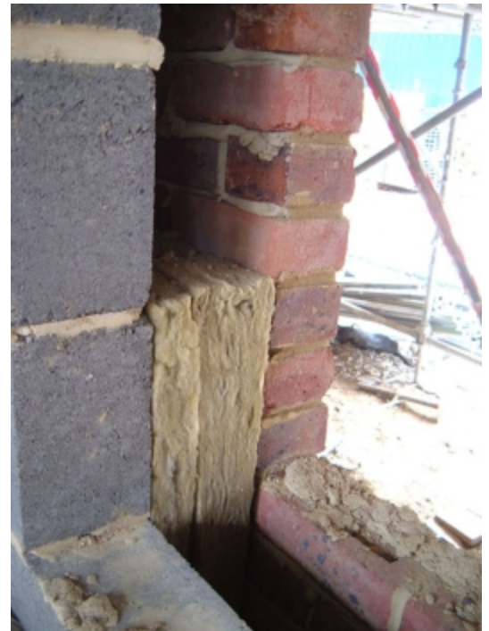
TYPICAL OLD-STYLE BRICK & BLOCK WALL SECTION AT WINDOW OPENING